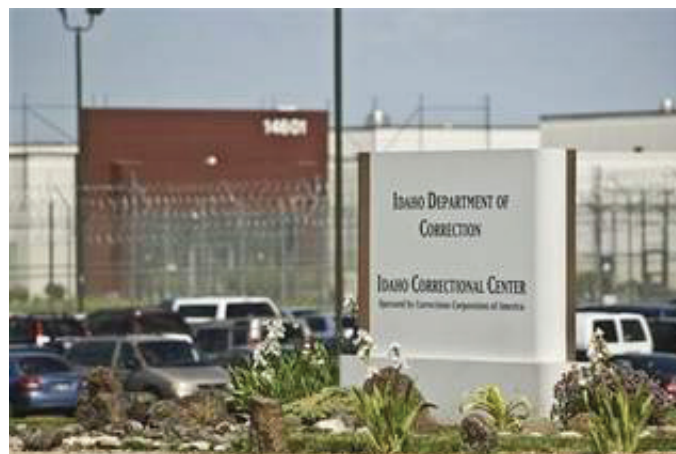
Two of our plaintiffs gave their depositions at correctional institutions.