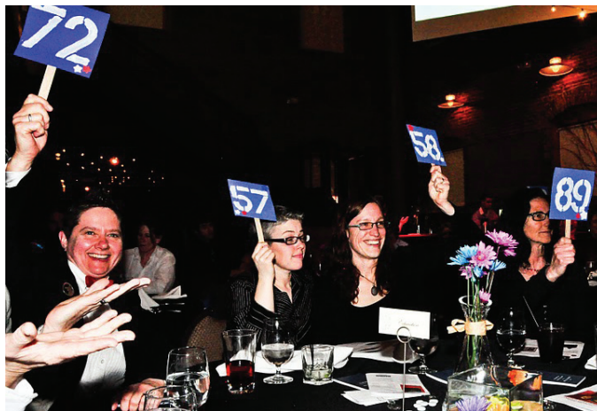
Our event raised almost $22,000!

We would like to thank all of you who were able to join us in making this event such a memorable one for us along with our sponsors who helped make the evening possible. To see photos from the event, visit our Facebook page and don’t forget to “Like” us!