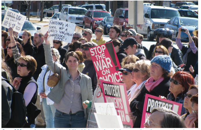
Over 200 people protesting a bill which mandated ultrasounds prior to an abortion.

right to enforce time, place, manner restrictions on speech, but they must be content neutral. Preliminary injunctions are issued on the "likelihood" of winning a case not the facts, so stay tuned to see if Occupy Boise wins what is now a litigation battle.