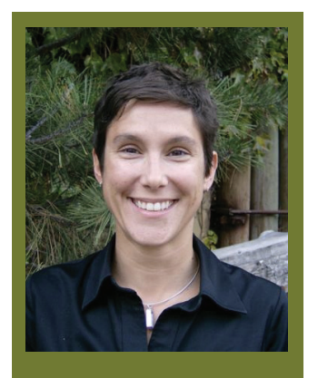
THESE EXTRAORDINARY TIMES CALL FOR EXTRAORDINARY MEASURES AND EXTRAORDINARY SUPPORT.

At the same time, today, a decade after 9/11, we continue to confront the legacy of government abuses carried out in the name of national security. The government continues to detain individuals without charges or trials